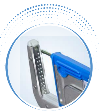
Cutting-Guide For safe & precise transection