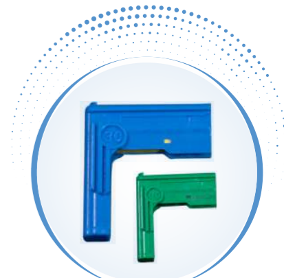
Cartridges For varied tissue thickness