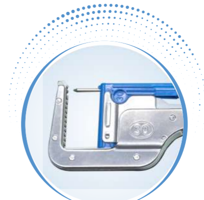
Tissue Retaining Pin Avoids tissue slip-out