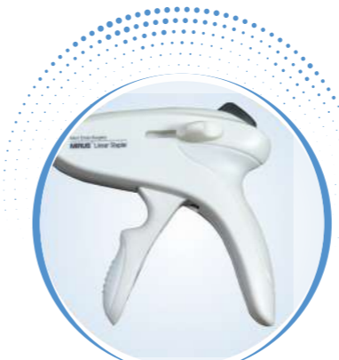
Dual Function Handle For repositioning closure & stapling

The ergonomic design with single handed closing & firing lever facilitates user comfort and control. Staple formation creates the perfect 'B' shape on each and every firing for improved clinical performance.