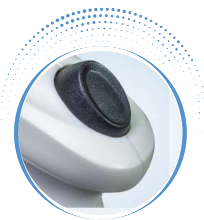
Quick Release Button For easy jaw opening