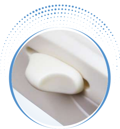
Retaining Pin Knob Advances tissue retaining pin